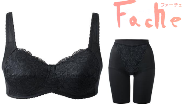
Softly along the skin, casually correct bodyline.