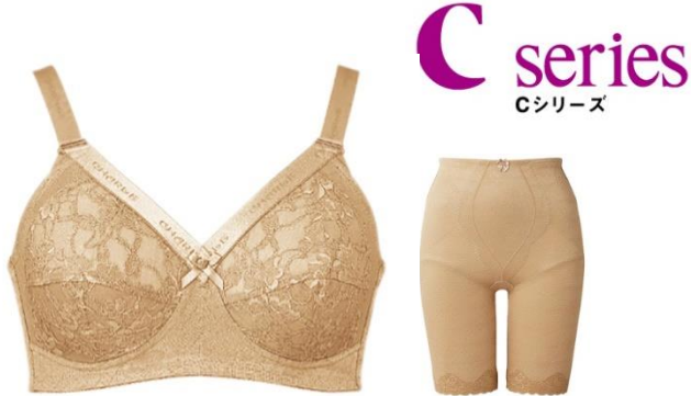
Set bodyline beautiful, comfortable touch and correction