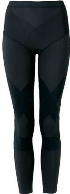
Bottom wear for muscles and joint support