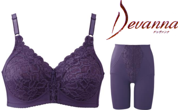
Arrange ideal body, produce elegant appearance

Along with our original body data, emphasize monitor voice and feeling of wear. Every time a new product is created, we make a new pattern.