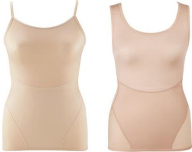
Inner wear for beautiful posture