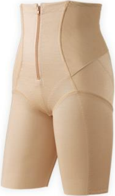
Girdle for belly and thigh support

Products developed by our unique technique and certain theory, bring you active days.