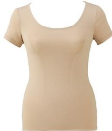
Inner wear for shoulder stretch