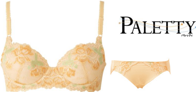
Easy action, lightly feeling, body-making with colorful items