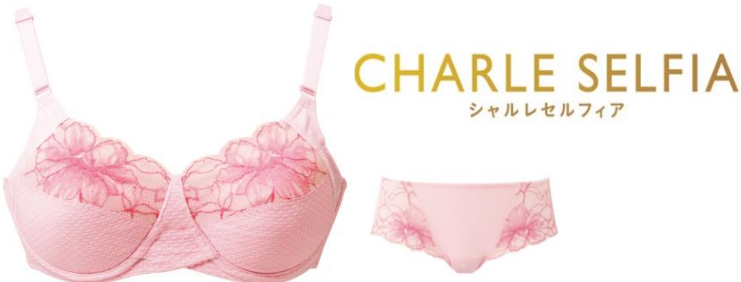
Caring Breast by every body movement, "Figure-Enhancing Bra" and coordinated underpants.