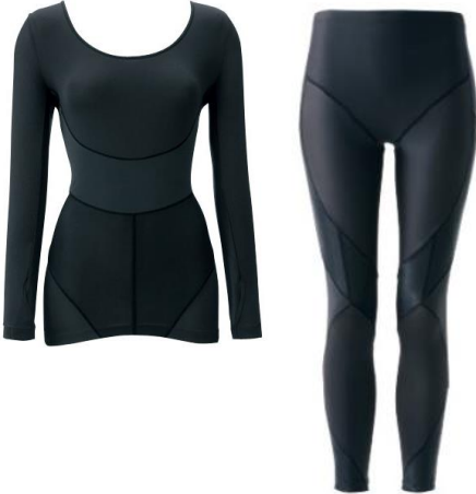
Inner and bottom wear for diet