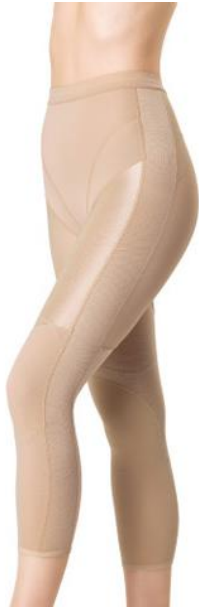
Bottom wear for knee support